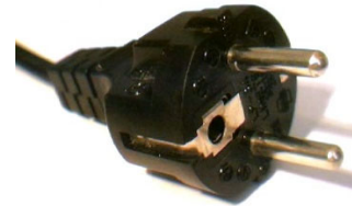
Hybrid CEE 7/7 plug

Please ensure that your electrical devices are designed for use with 220V, 50Hz systems and comply with European safety standards.