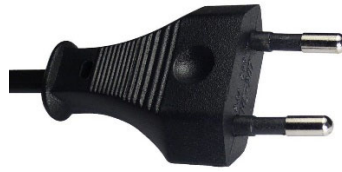
CEE 7/16 Alternative II "Europlug" (Type C)