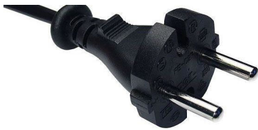
CEE 7/17 unearthed plug